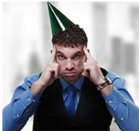
IS YOUR RECOGNITION PROGRAM FAILING?